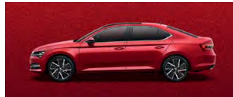
VELVET RED METALLIC