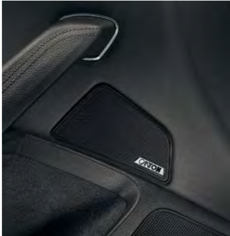
CANTON SOUND SYSTEM Enjoy absolute sound clarity, whether it's music or the spoken word, on the Canton Sound System with twelve speakers, including a speaker in the dashboard and subwoofer in the luggage compartment.