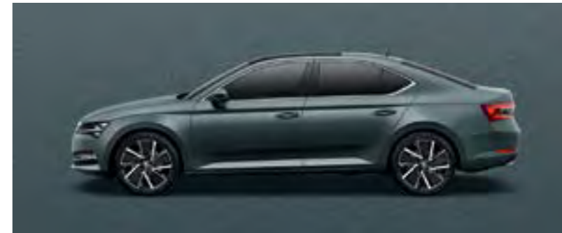
QUARTZ GREY METALLIC