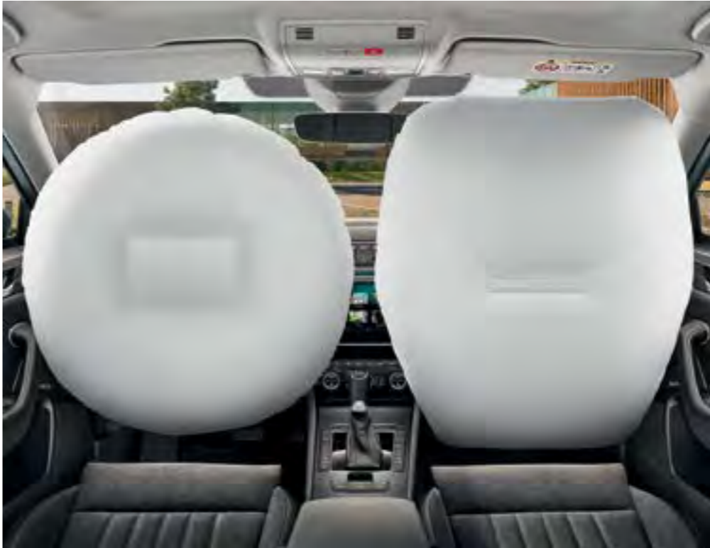
FRONT DRIVER AND PASSENGER AIRBAG While the driver airbag is enclosed in the steering wheel, the passenger airbag is located in the dashboard. If needed, this can be deactivated when a child seat is installed on the front seat.

In extreme situations, where the driver cannot actively influence the outcome, the car's passive elements take over – like airbags. You can have your SUPERB equipped with up to nine of them.