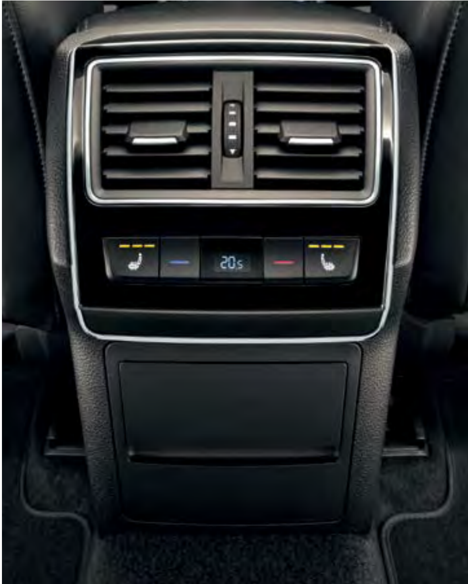
COMFORT IN THE BACK On the rear part of the Jumbo Box you will find a socket (230 V or 12 V) and two USB slots, enabling mobile phone charging. In the car equipped with 3-zone Climatronic air conditioning, you will also find the control for the rear seat zone here.