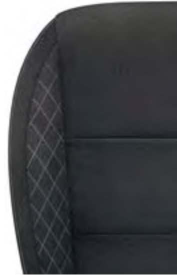
AMBITION / STYLE / L&K BLACK