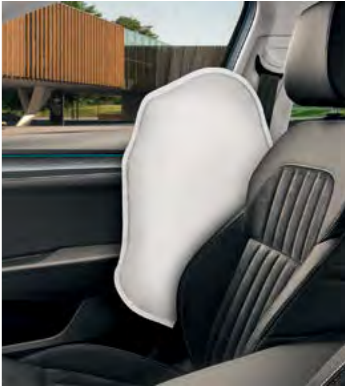
FRONT AND REAR SIDE AIRBAGS These four airbags protect the pelvis and chest of the driver and other passengers in the event of a side collision.